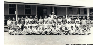
Mucky Duck Bush Band